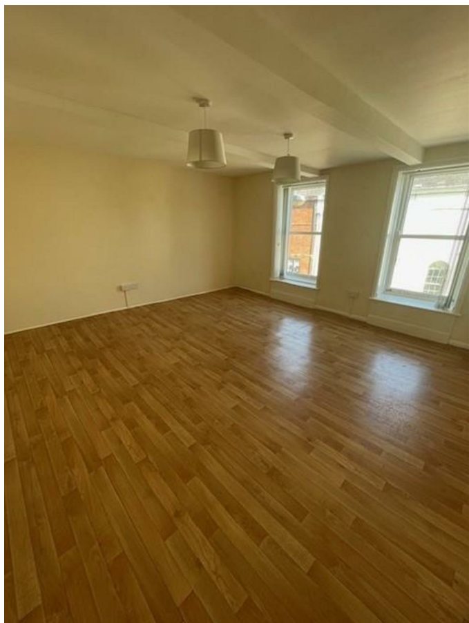
Large newly decorated bedroom with wood effect flooring, electric wall mounted heater with two sash windows to front