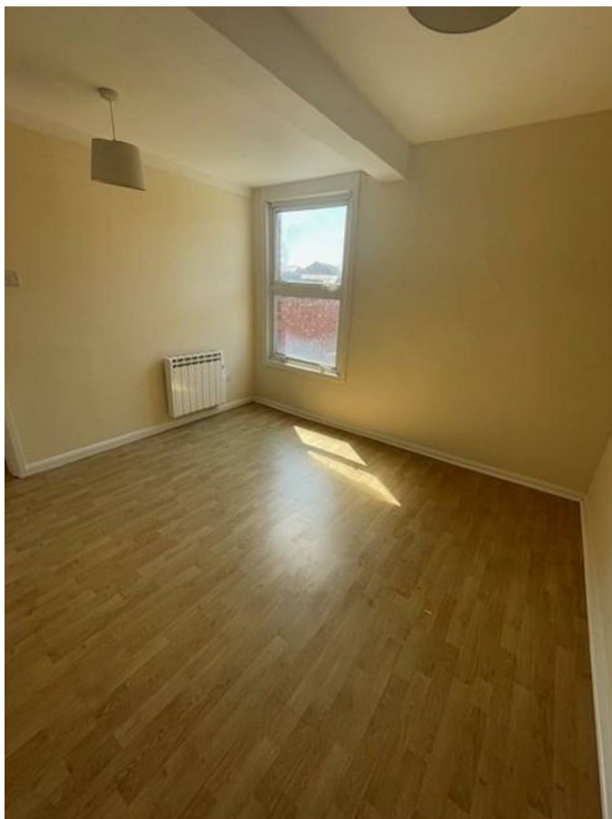
Double bedroom, Newley decorated, wall mounted electric heater with wood effect flooring and window to rear.